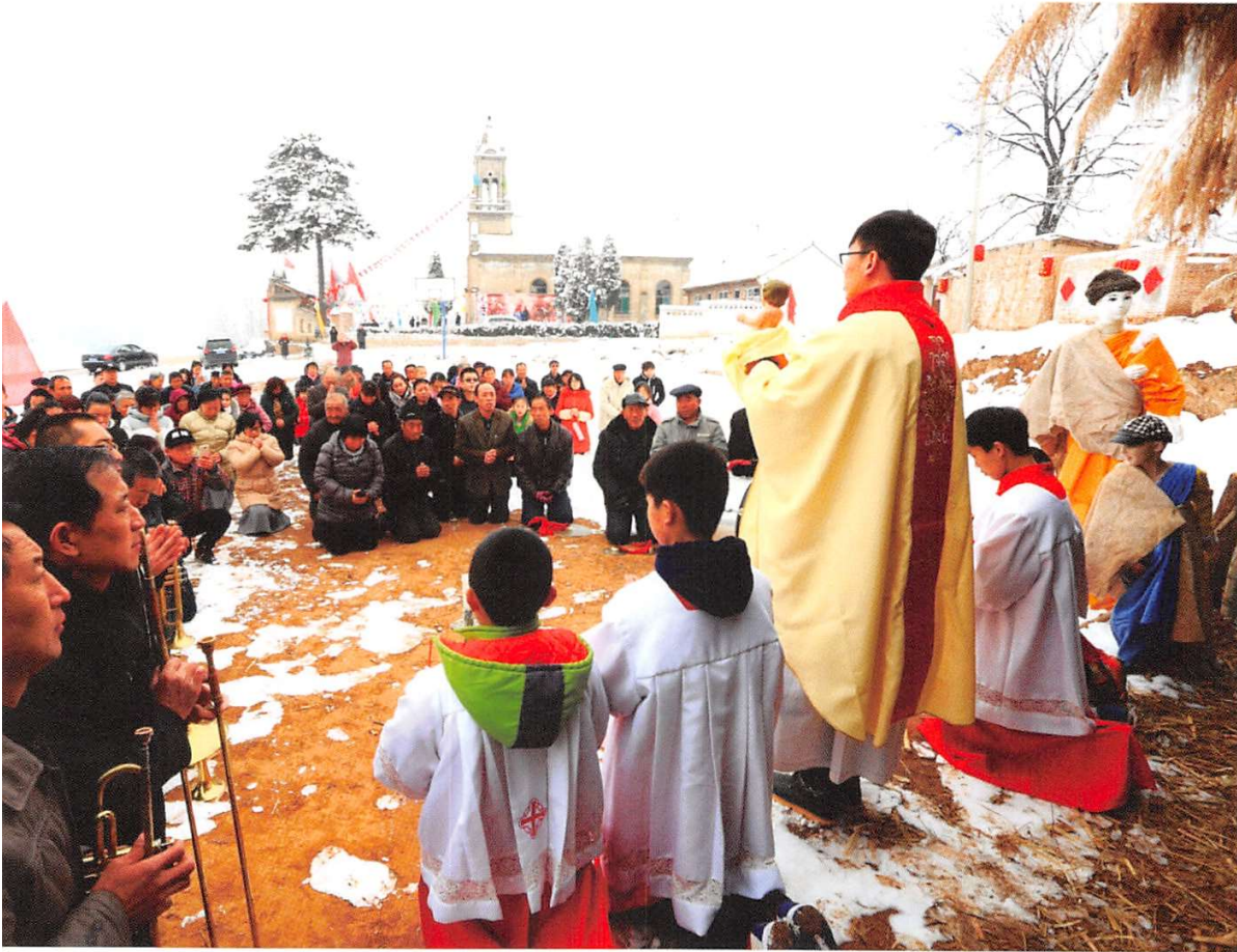
山西省中部一天主教村舉行聖誕節露天感恩禮儀。On Christmas day the faithful of a Catholic village in the middle of Shanxi Province celebrate the Eucharist in the open air.