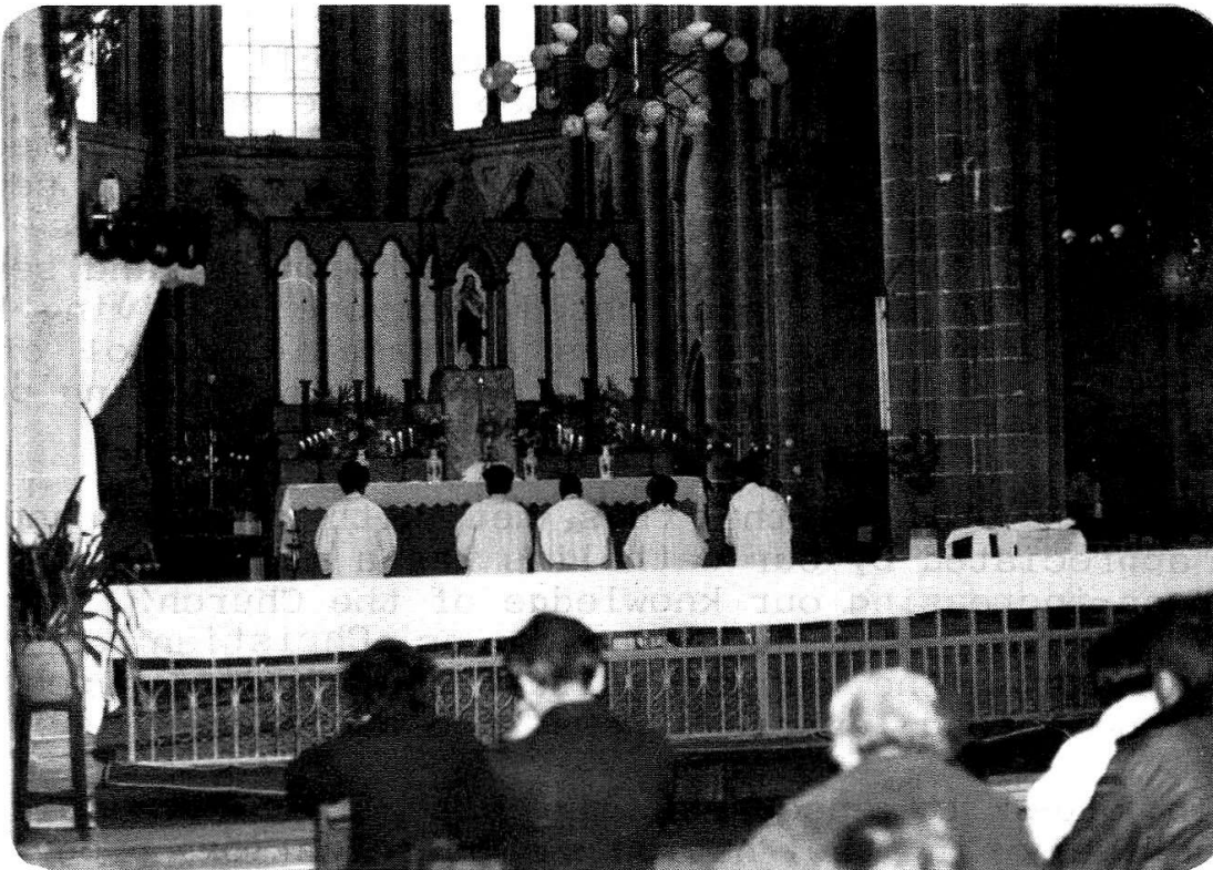
Benediction at the main altar

Catholics often meet to study and discuss current events and policies. When important feasts coincide with national festivals, we celebrate both together.