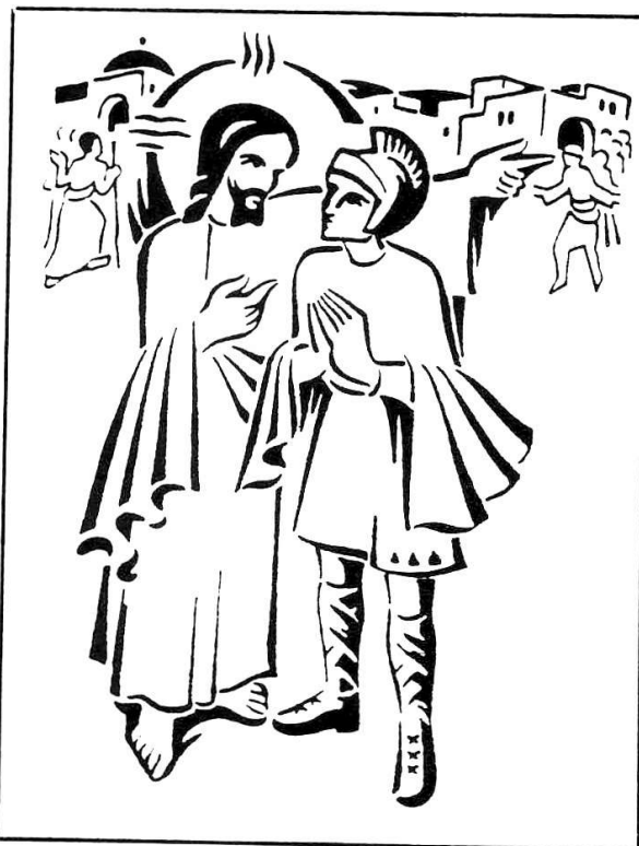
Jesus urges us to respond to his guidance

who believes in Him, and He urges us to respond to such guidance. Every inspiration that comes from God, however, must be in agreement with the teachings and revelations of the Bible. At the same time, the Bible informs us as to what kind of attitudes and approaches we must adopt when responding to God's inspiration. First, we must learn how to discern God's Will with the help of the Bible, so that we may be able to make the right decisions in the concrete circumstances of our daily lives; then, we must ask the Holy Spirit to grant us the strength to implement God's Will on a day to day basis - only by taking this step, can we integrate our faith into our daily lives. By becoming well versed in the Bible, it follows that we not only gain knowledge about God, but also, through the Bible's teaching, we can come to know more clearly how to establish the kind of practical and intimate relationship with God that will allow our life of Christian faith to develop and mature.