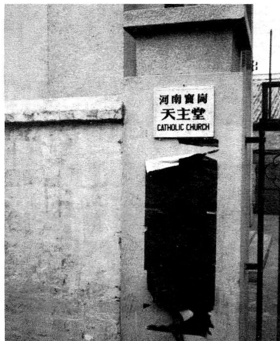
2. The Front Gate of Holy Family Church