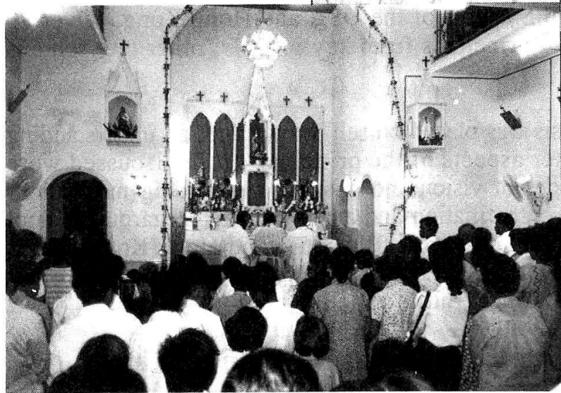
Parishioners and guests crowd new church for Mass of blessing.