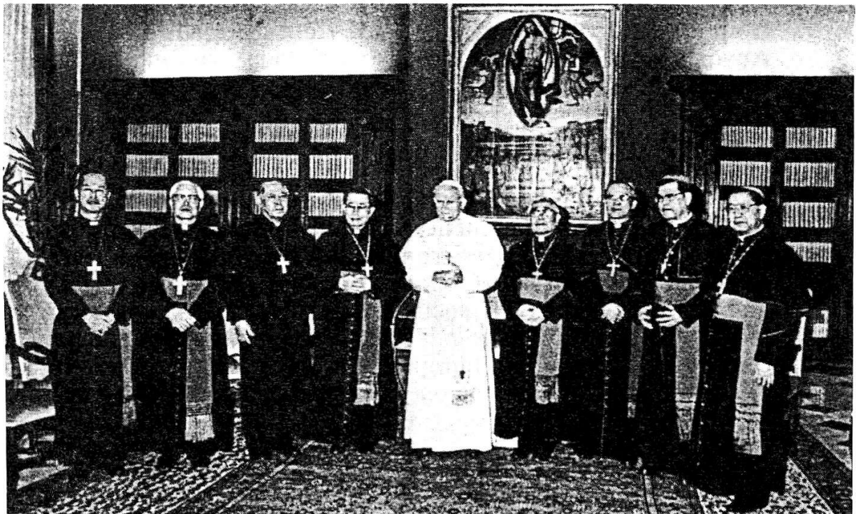
Taiwan Bishops with Holy Father during ad limina visit.